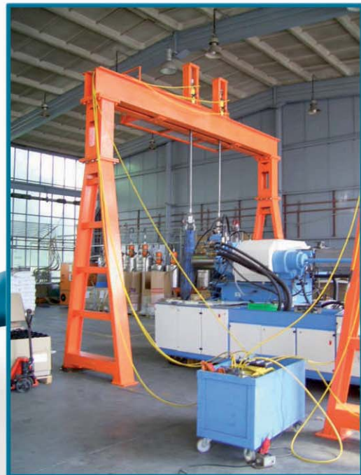
Loading of an injection moulding machine – 20 tonnes.