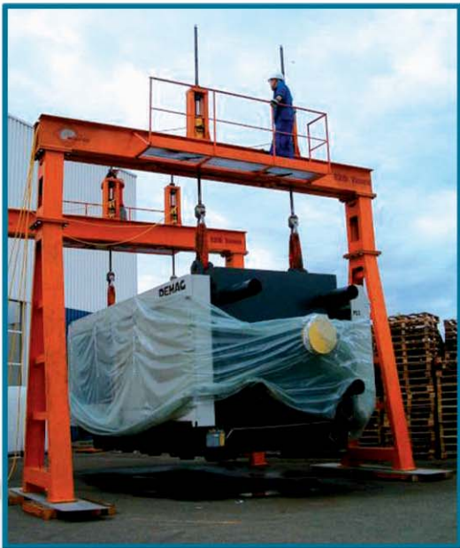
Loading of a pressing element of DEMAG machine – 60 tonnes.

We are very proud of our extensive experience gained throughout Europe. We have been cooperating with many international companies such as: KNAUF Industries, Groupe Plastivaloire, PHILIPS, Lemahieu, NALCO.