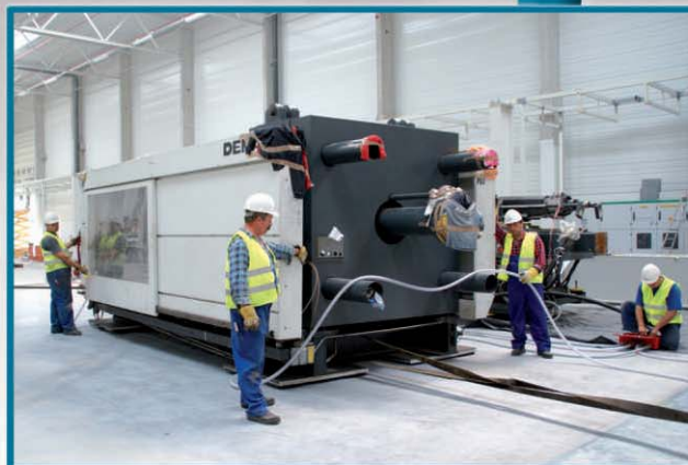
Shifting of 100- tonne machine with air-cushion machines.